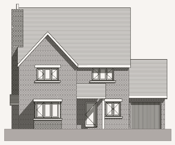
Front - South East Elevation