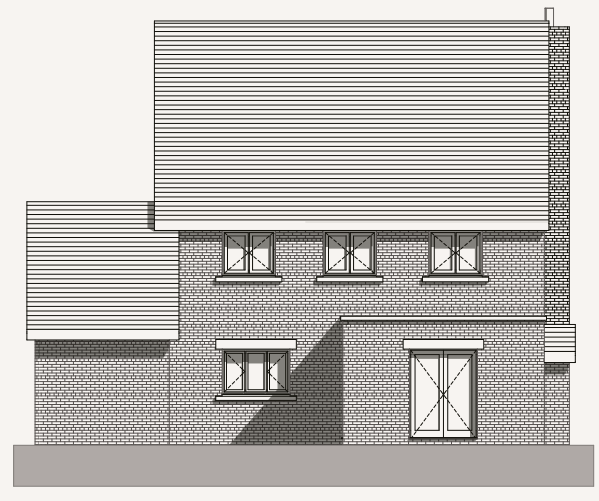
Rear - North West Elevation