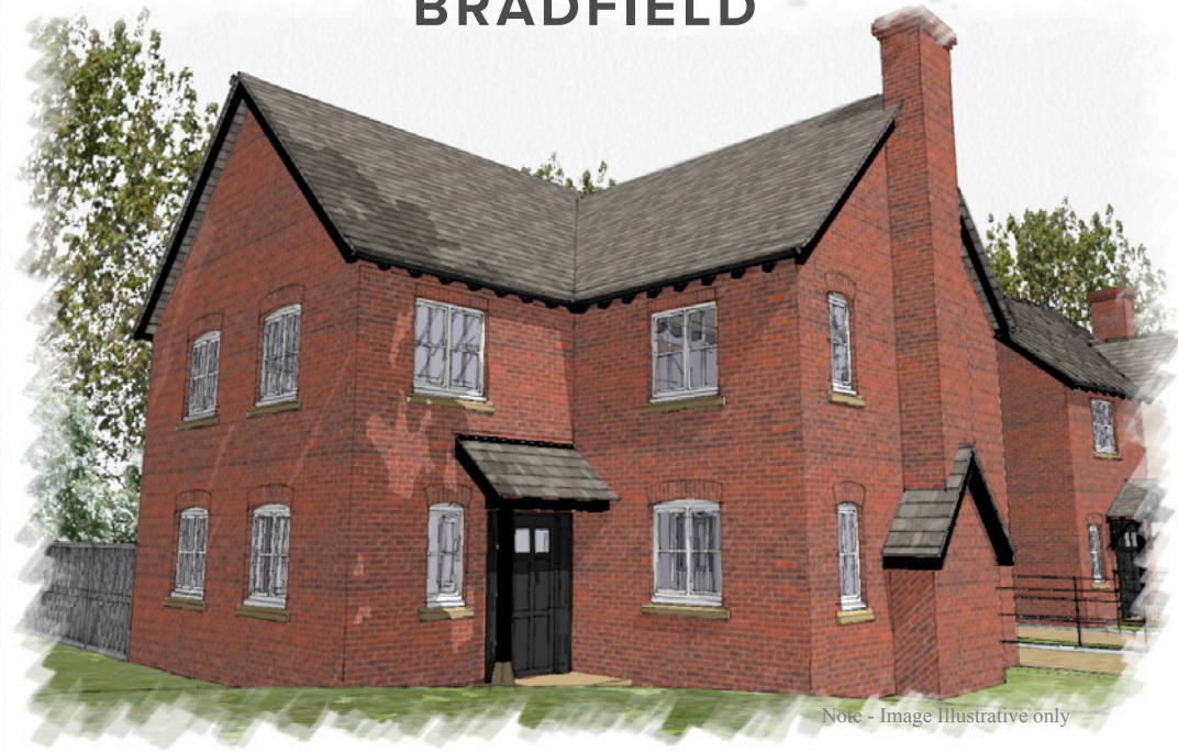
Note - Image Illustrative only