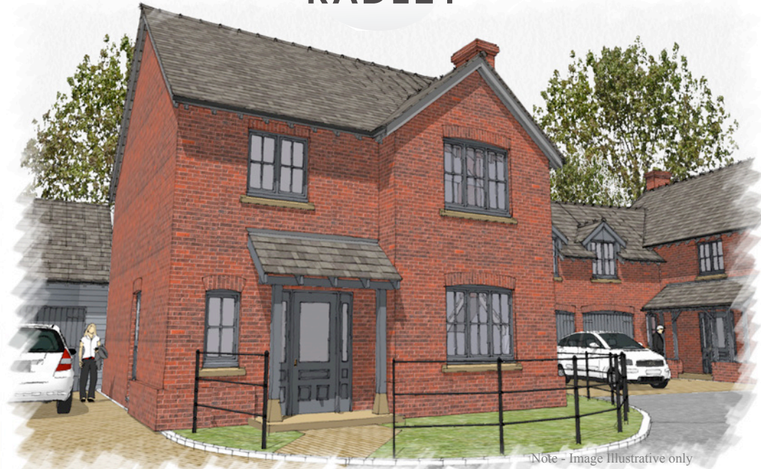
Note - Image Illustrative only